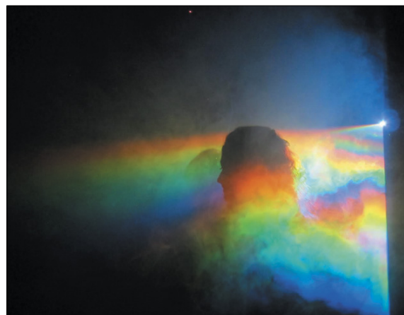
Light is magic. It is invisible when travelling and is revealed only when interacting with matter.

Since no earmarked funding was available for the Swedish celebrations, we decided to include light-related themes or activities in festivals, magazines, teacher conferences, and lecture series, and use a dedicated website 1 to collect information about the various activities. Monthly themes, featuring suggested observations, experiments and links to more material, included: lighting the environment, light for health and life, invisible light, sunlight, radiation safety, light in the service of research, tips for the summer holidays, and light and art. A Facebook page 2 was created to share activities, articles, photos, movies, and other interesting links, as well as a YouTube channel to present researchers working on different aspects of light, from fundamental properties to applications in a wide variety of fields.